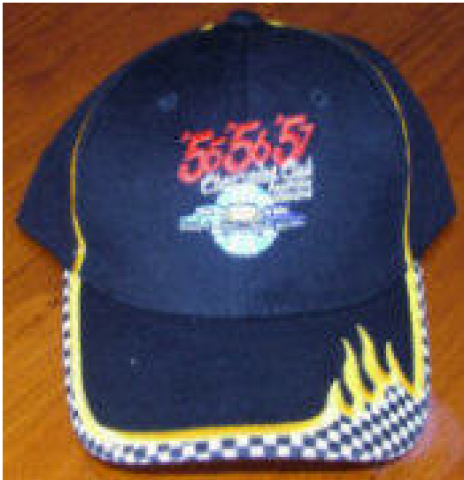
Club Cap $15.00