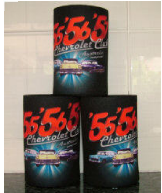
Stubby Holder $5.00