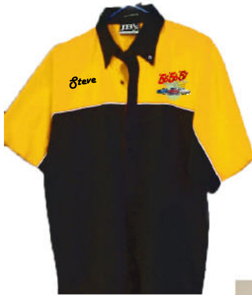
Bowling style shirts Mens Shirt $35.00 Embroidery of name $5.00